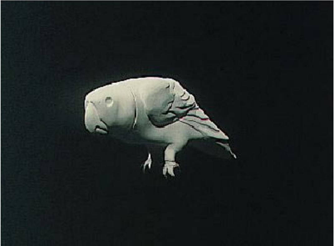
Parrot (Your Fortune One $), 1996, plaster parrot on perch with electronic equipment.