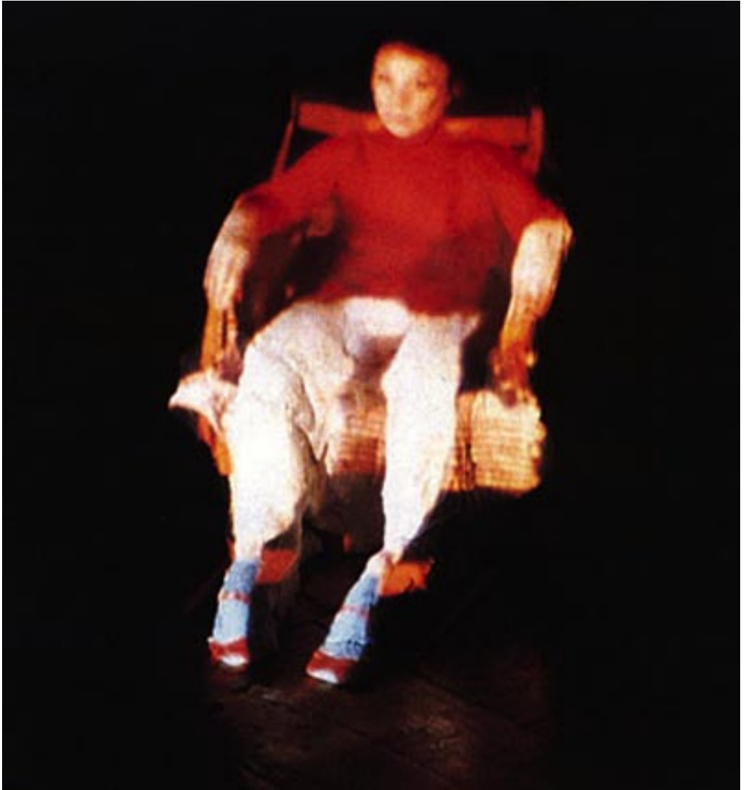
At The Shrink's, 1975/1997, sculpture, video projector, DVD player with audio.