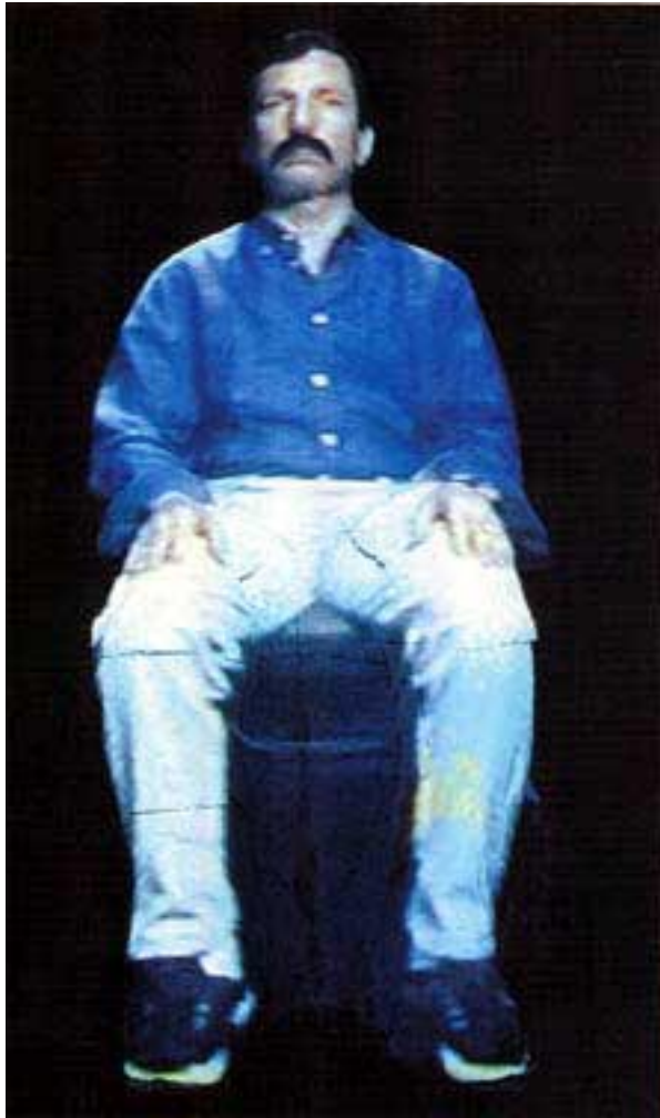
Dal Vivo (Life), 1998, Video installation.