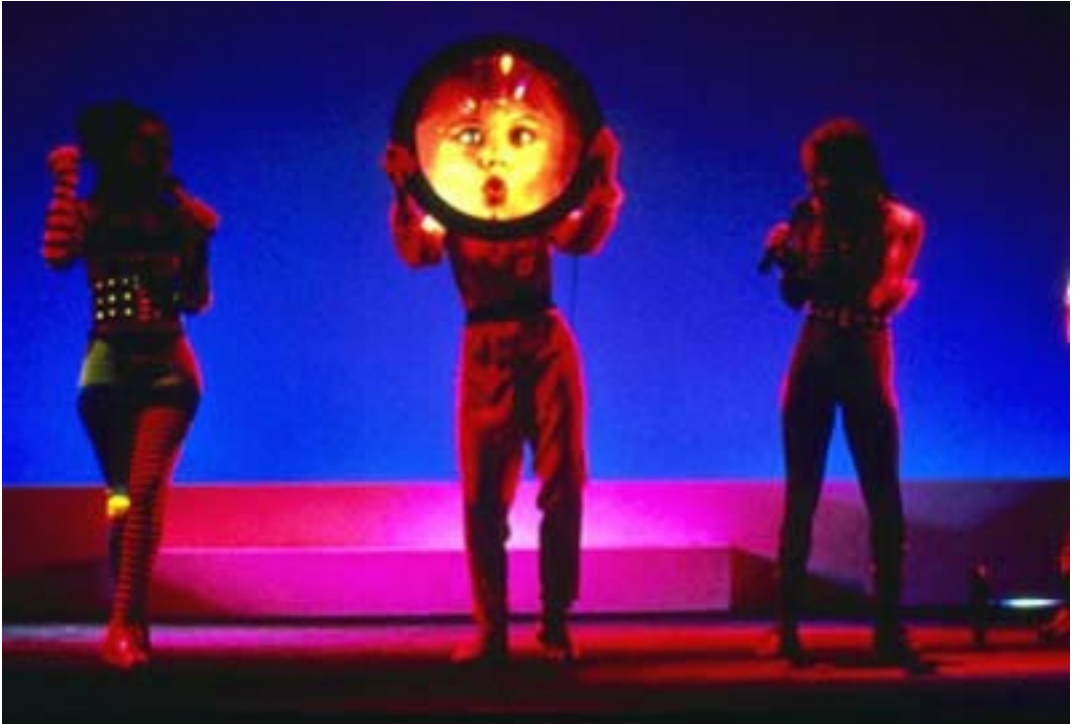
The record of the time, 2005, performance.