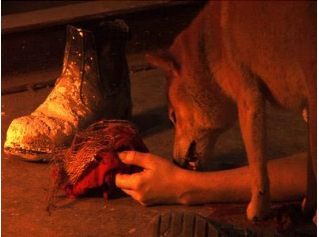
The Fox, 2005, High Definition video installation.