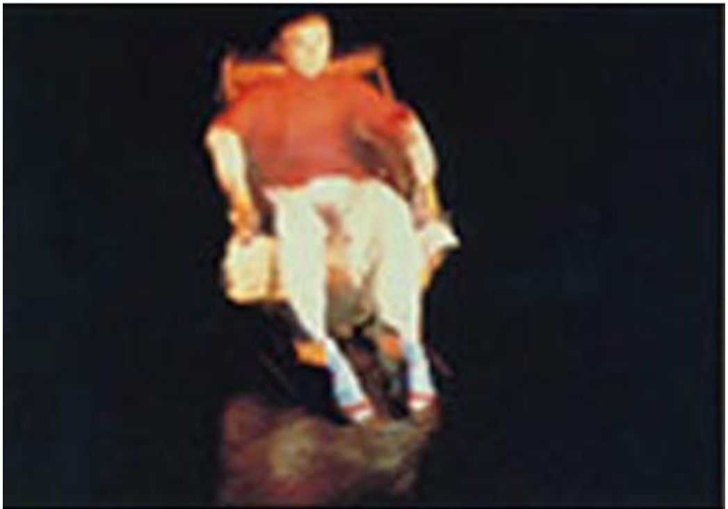
At The Shrink's, 1975/1997.