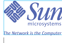
Preferred width 1 inch